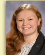
Biology, Global Health Certificate: Athletic Healthcare