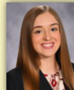
Life Sciences Communication Certificates: Public Policy, Entrepreneurship, Digital Studies