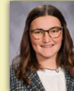
Biological Systems Engineering Certificate: Fermented Foods and Beverages