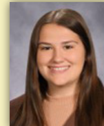
Agricultural & Applied Economics, Life Sciences Communication