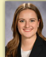
Dairy Science Certificates: Life Sciences Communication, Art Studio