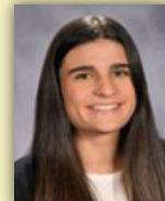
Dairy and Food Animal Management