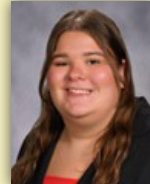
Communication Sciences and Disorders Certificate: Disability Rights and Services