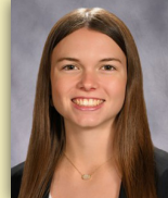
Agricultural & Applied Economics, Life Sciences Communication Certificate: Digital Studies