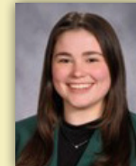
Agricultural & Applied Economics, Life Sciences Communication