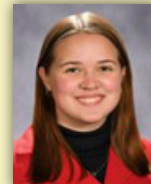
Textiles & Fashion Design