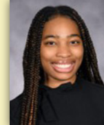
Animal and Veterinary Biosciences