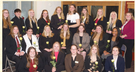
Fall 2024 New Members