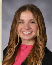
Dairy Science Certificates: Agricultural Business Management, Science Communication