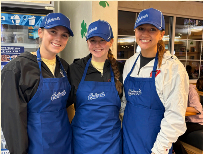
Culver's Scoopie Night