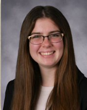
Agronomy, Dairy Science