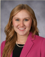
Life Sciences Communication Certificate: Digital Studies