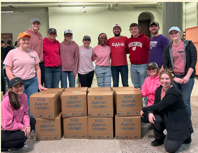
Rally to Fight Hunger