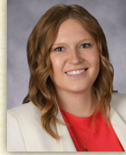
Agricultural Business Management, Communication Arts Certificates: Public Policy, Integrated Liberal Studies