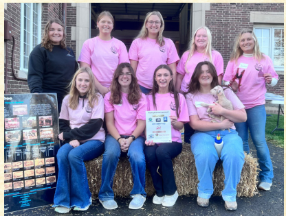
Badger Ag Day