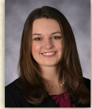
Dairy Science Certificates: Agricultural Business Management, Science Communication