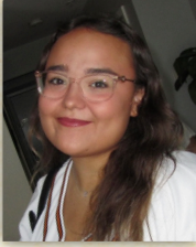
Animal & Veterinary Biosciences