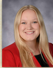
Dairy Science Certificate: Agricultural Business Management