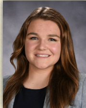
Agricultural & Applied Economics Certificate: Agricultural Business Management